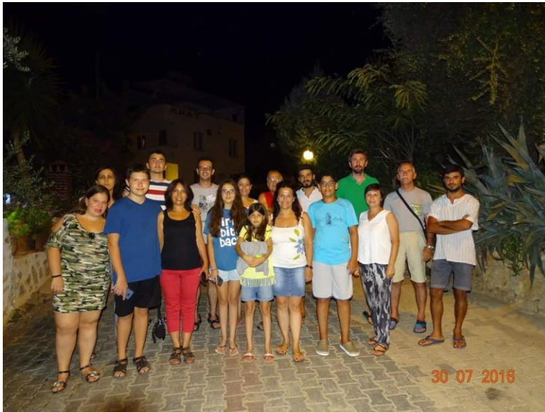
Photo of people after observing juvenile turtle's walk to the sea.