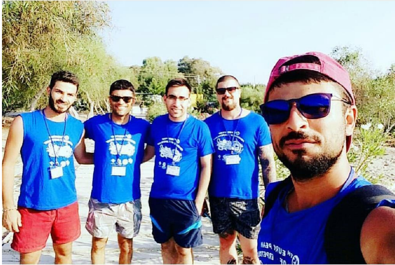
Officers and volunteers also participated in field studies.