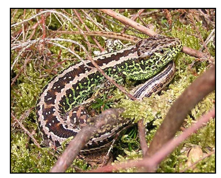
Figure 1: Male Sand Lizard Lacerta agilis agilis