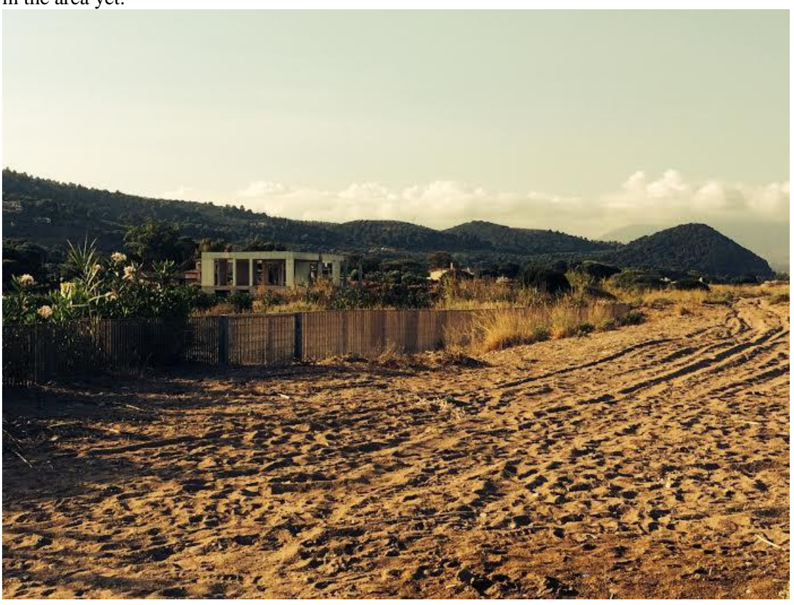
Picture 4 . Dunes have not yet been restored from the destruction the sustained die to the road construction.