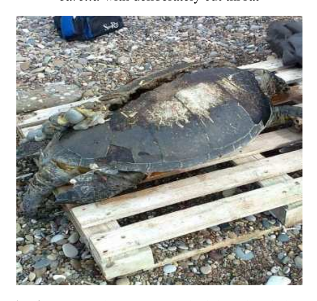
Fig. 4 . 8 December 2011. Dead adult male Chelonia mydas with severe propeller injuries