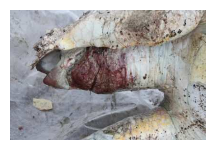
Fig. 2. 28 February 2012. Dead adult male Caretta caretta with deliberately cut throat