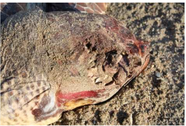
Fig.3. 13 January 2012. Dead adult Caretta caretta with deliberate head wound.