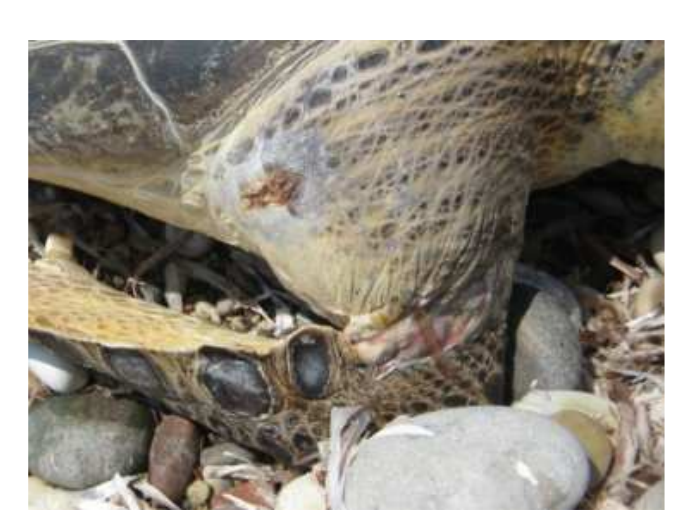
Fig. 5. 5 September 2011. Dead adult male Chelonia mydas with broken and torn flippers