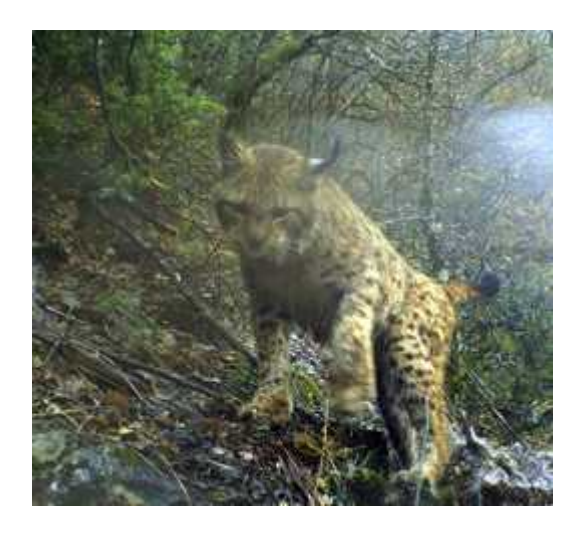
Document presented by KORA, Switzerland