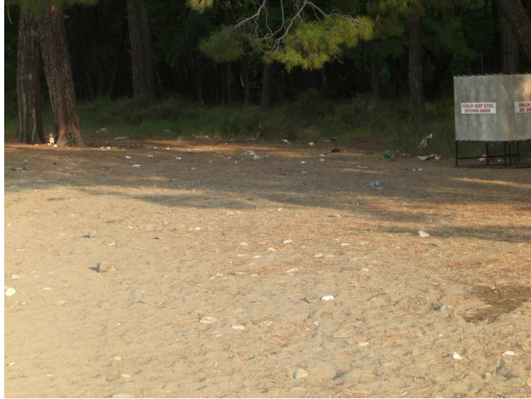
Fig. 6: July 2010. Fethiye, SPA. Yanıklar. Plastic bottles litter the entire beach.