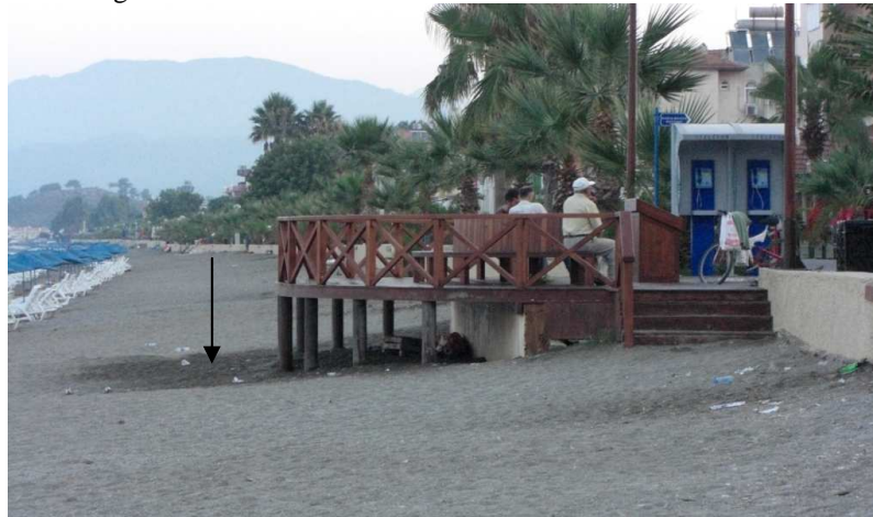
Fig 2: July 2010. Fethiye, SPA. Çaliş. New wooden viewing platform at Calis Beach Promenade. Note wet sand next to the wooden stakes due to irrigation of palms along the promenade.