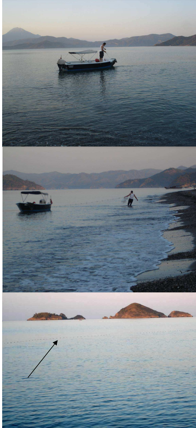
Fig. 9: July 2010. Fethiye, SPA. Yanıklar. Fishing with nets close to the nesting beach during the hatching period.