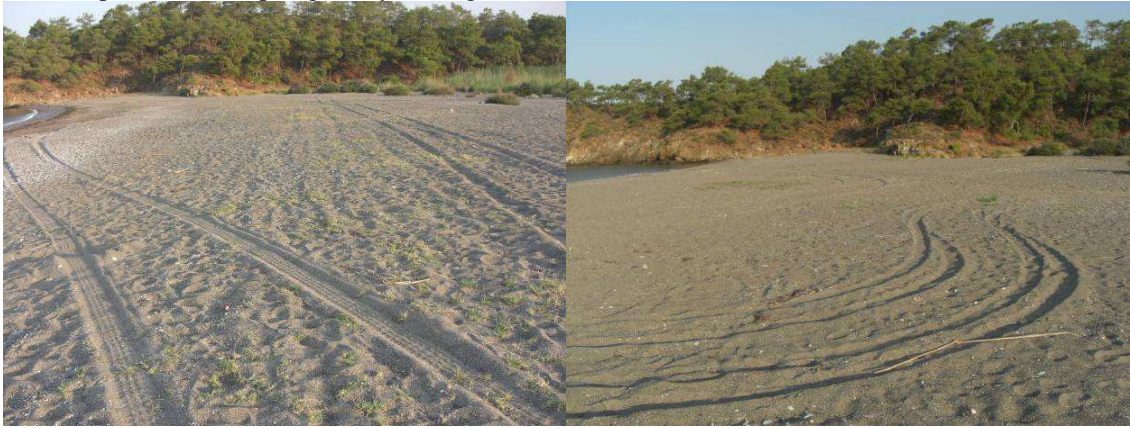
Fig. 5: July 2010. Fethiye, SPA. Yanıklar. Vehicles continue to drive along the nesting beaches.