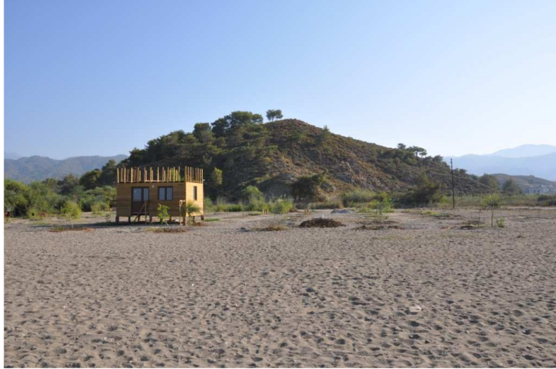
Fig. 11: September 2010. Fethiye, SPA. Çalış. Construction is underway of two such wooden huts with tree-trunk stilts forced into the sand approx. 50m from the waterline between the 'Surf Café' and 'Sunset Beach Apts'.