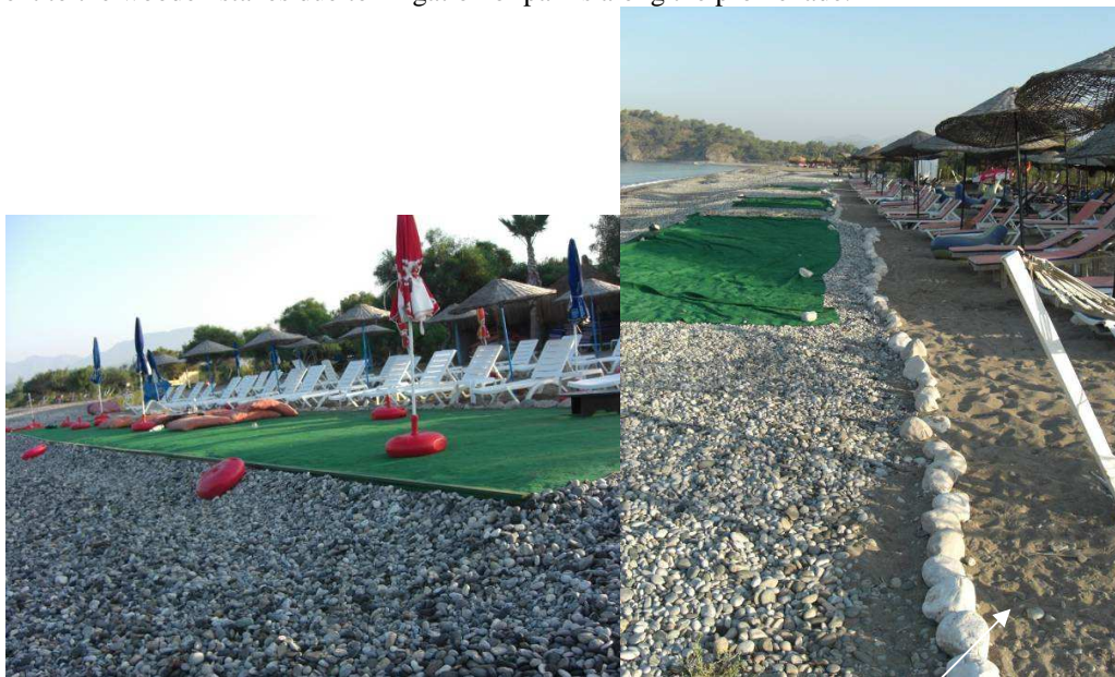
Fig.3: July 2010. Fethiye, SPA. Çaliş. Surf Café and Sunset Garden Beach Club continue to use plastic carpets on the beach and large stones on the nesting beach.