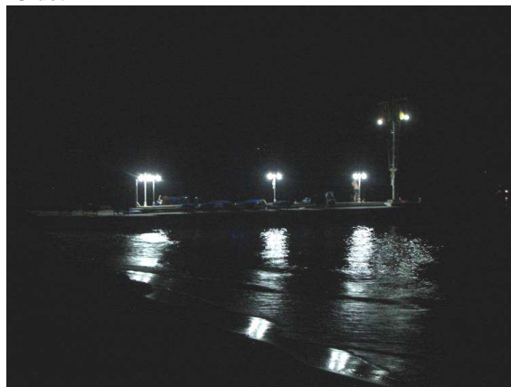
Fig. 8: July 2010. Fethiye, SPA. Yanıklar. “Lykia Botanika Fun Club” pier’s new illumination with bright lights throughout the night.