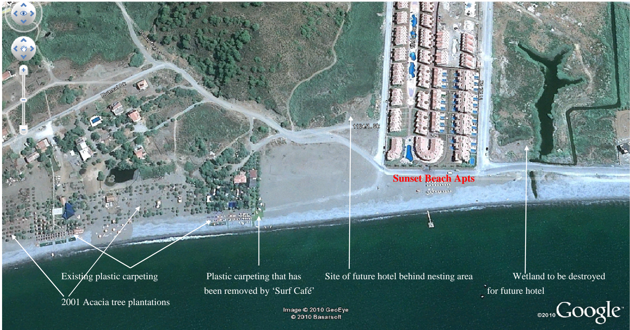
Fig. 10: 2010. Fethiye, SPA. Çalis beach section.