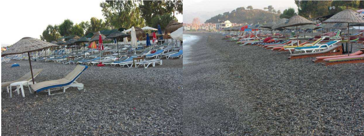
Fig.1: July 2010. Fethiye, SPA. Çaliş. Dense rows of beach furniture, some of which are too close to the waterline, remain on the beach during the hatching and nesting period, as reported in 2009, hindering nesting female turtles and/or hatchlings.