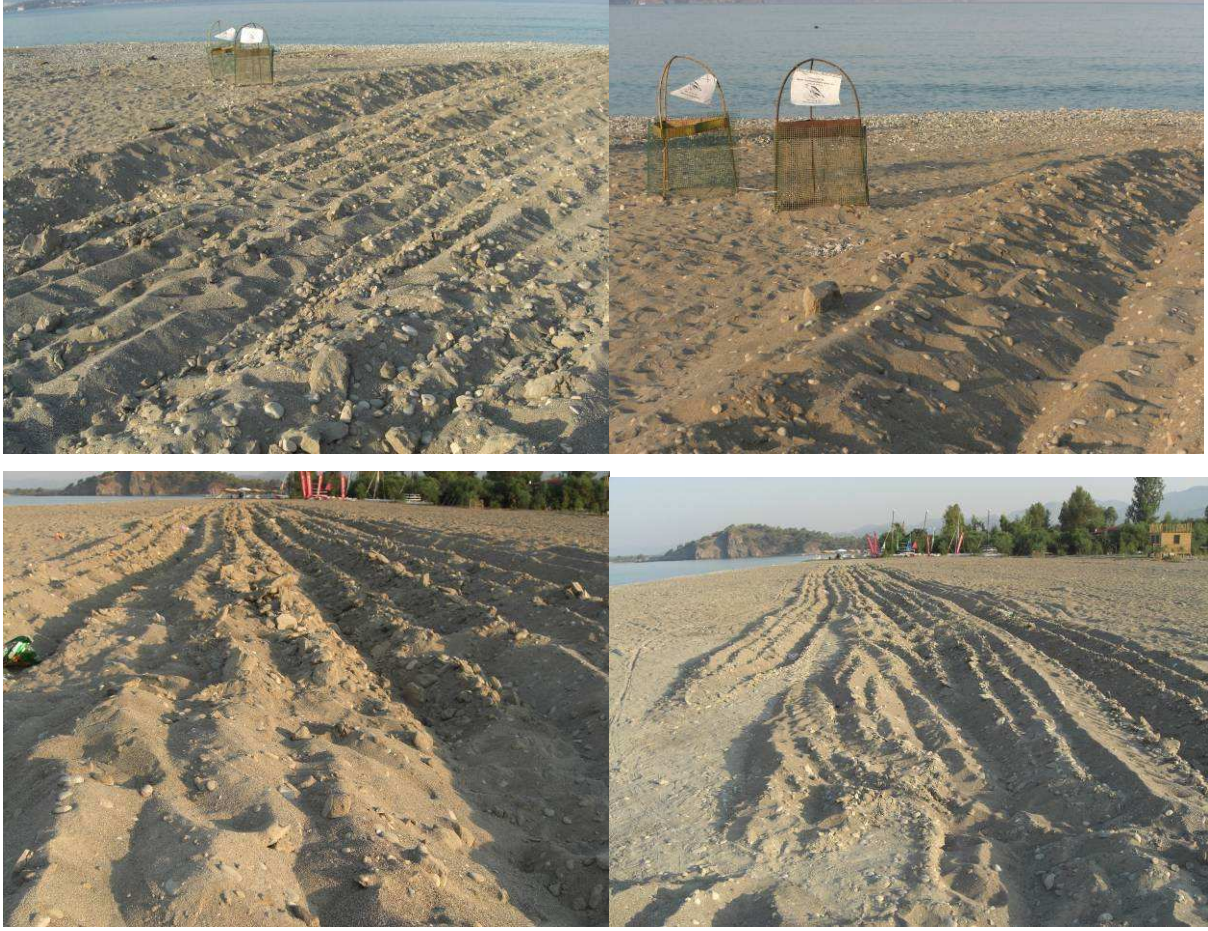
Fig. 4: July 2010. Fethiye, SPA. Çalış. During the hatching and nesting period the section between Surf Café and Sunset Apartments was ploughed by a dredger for no obvious reasons.