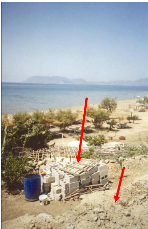
Photo 8. Daphne beach: We wonder what the building blocks are for? (18/7/03)