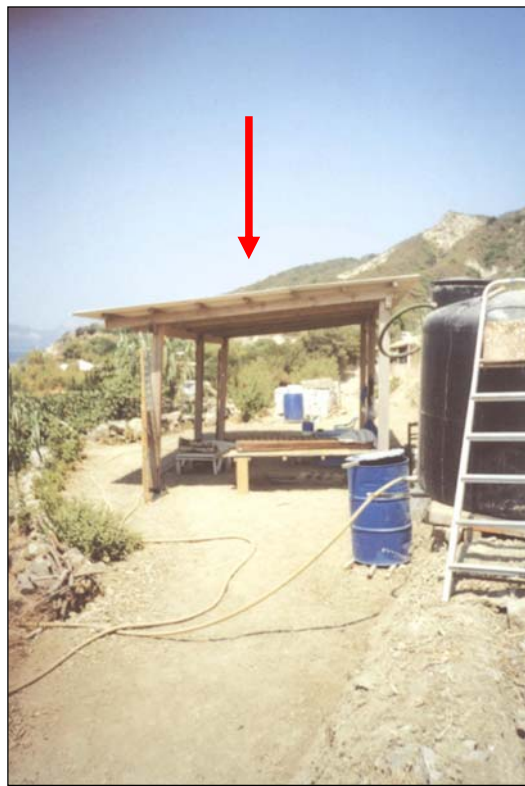
Photo 9. Daphne beach: Under construction! (18/7/03)