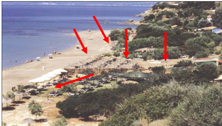
Photo 4. Daphne beach : Sea of umbrellas on lawns where sand dunes used to be.