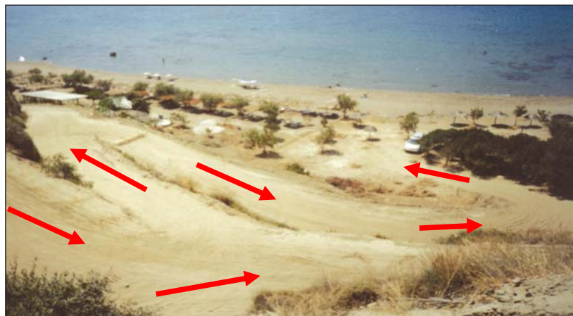
Photo 7. Daphne beach: New (2003) bulldozed road winds down to the nesting beach.