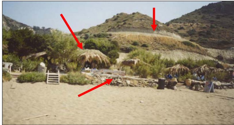
Photo 5. Daphne beach: Bar encroaches onto the nesting beach, with bulldozed road on the hill behind.