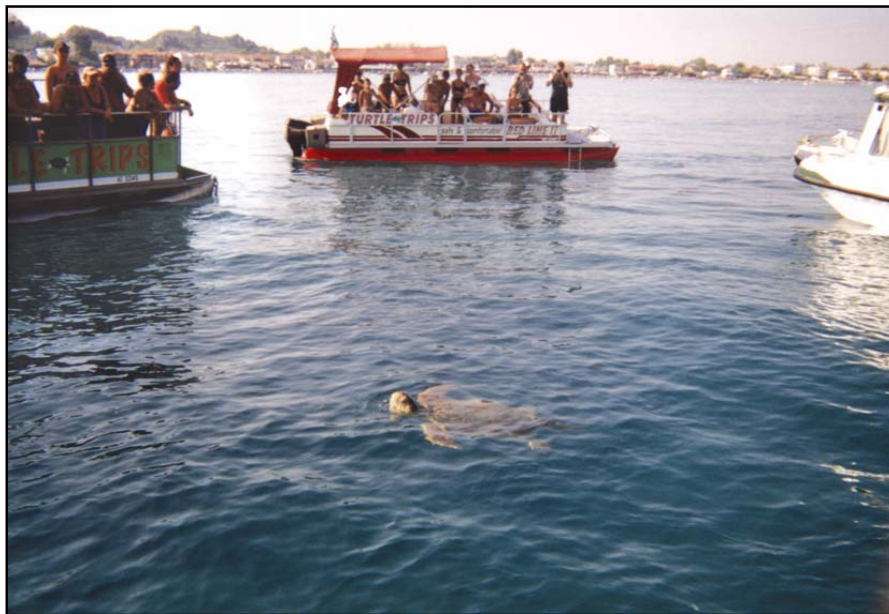
Photo 10: A loggerhead turtle is surrounded by 4 boats, three of them endorsed by the NMPZ, in blatant breach of 'turtle-spotting' guidelines.