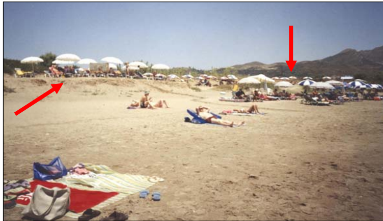
Photo 3. Kalamaki : Beach extension made by flattening the dunes to accommodate excess beach furniture.