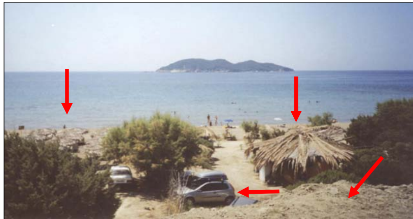
Photo 6. Daphne beach: Nesting beach with parked cars, umbrellas, "infill dumping" and new illegal thatched roof construction.