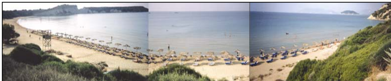
Photo 1: Gerakas beach with lifeguard post to the left. The number of umbrellas and sunbeds clearly exceeds legal limits.