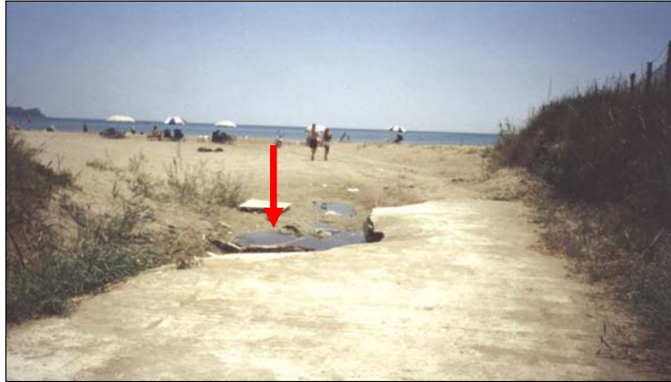
Photo 2. Kalamaki : Natural water course concreted over to form Hotel road to the nesting beach... meets its fate!